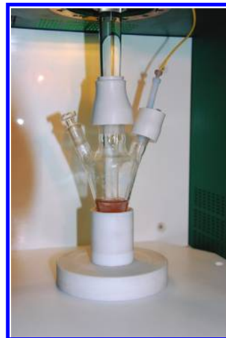
Figure 2. General setup for simultaneous US/MW irradiation.

As reported in the literature, β-CD forms a stable copper ion-CD inclusion complex 20 in which the two CD tori are